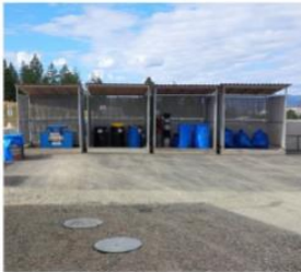
Figure 3. Sheltered Chain Link Containment Sheds