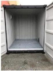
Example of 10ft 8'(w) x 10'(l) x 8'6 (h) steel shell with 660 liters secondary spill containment