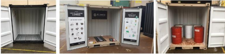
Examples of 6ft HC seacan 7' (w) x 6' (l) x 8' (h) steel shell with 356 liters secondary spill containment